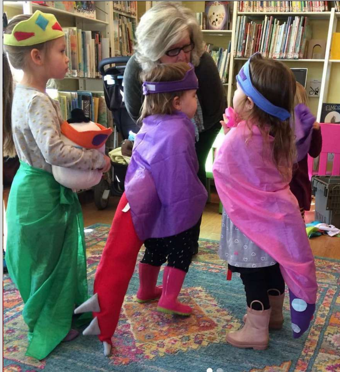
Tiny Tots Theater

Teens After Hours All Abilities Kids Science All Abilities Hours at Events All Abilities Music & Movement Hands On Senior Games Art After School After School Gaming Family Art Party Quiet Hours Shop Small Saturday Lunar New Year Teen Dungeons & Dragons Rainbow Connection Red Hook Grows Up Summer of Theater Summer Reading Challenge with Mill Road Fall Reading Club with Mill Road Homeschool Studio