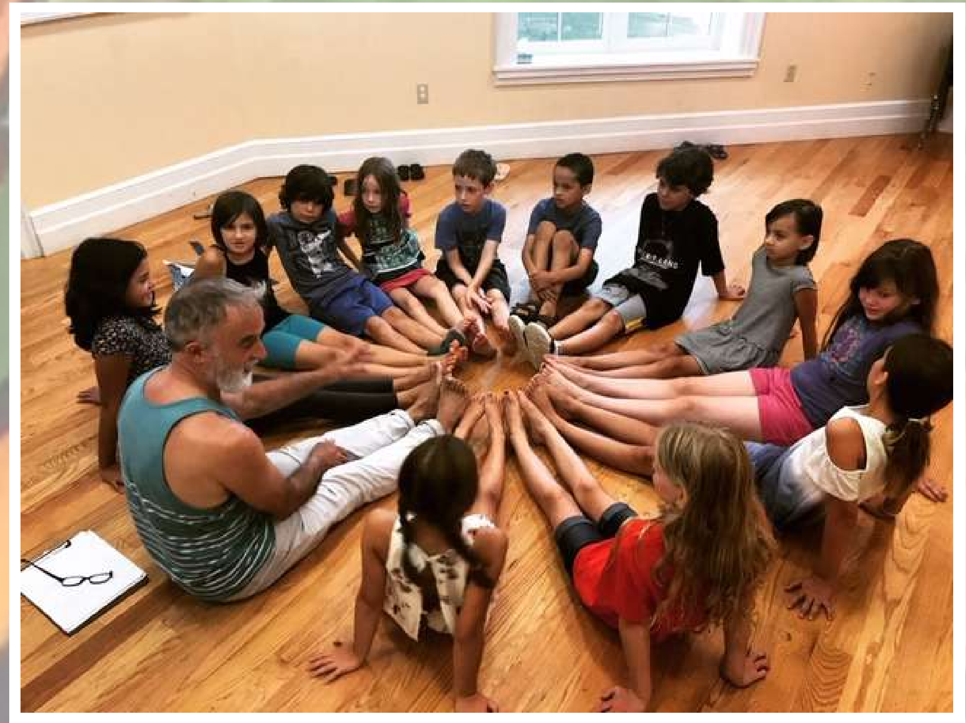
Actors warm up with Andres San Millan