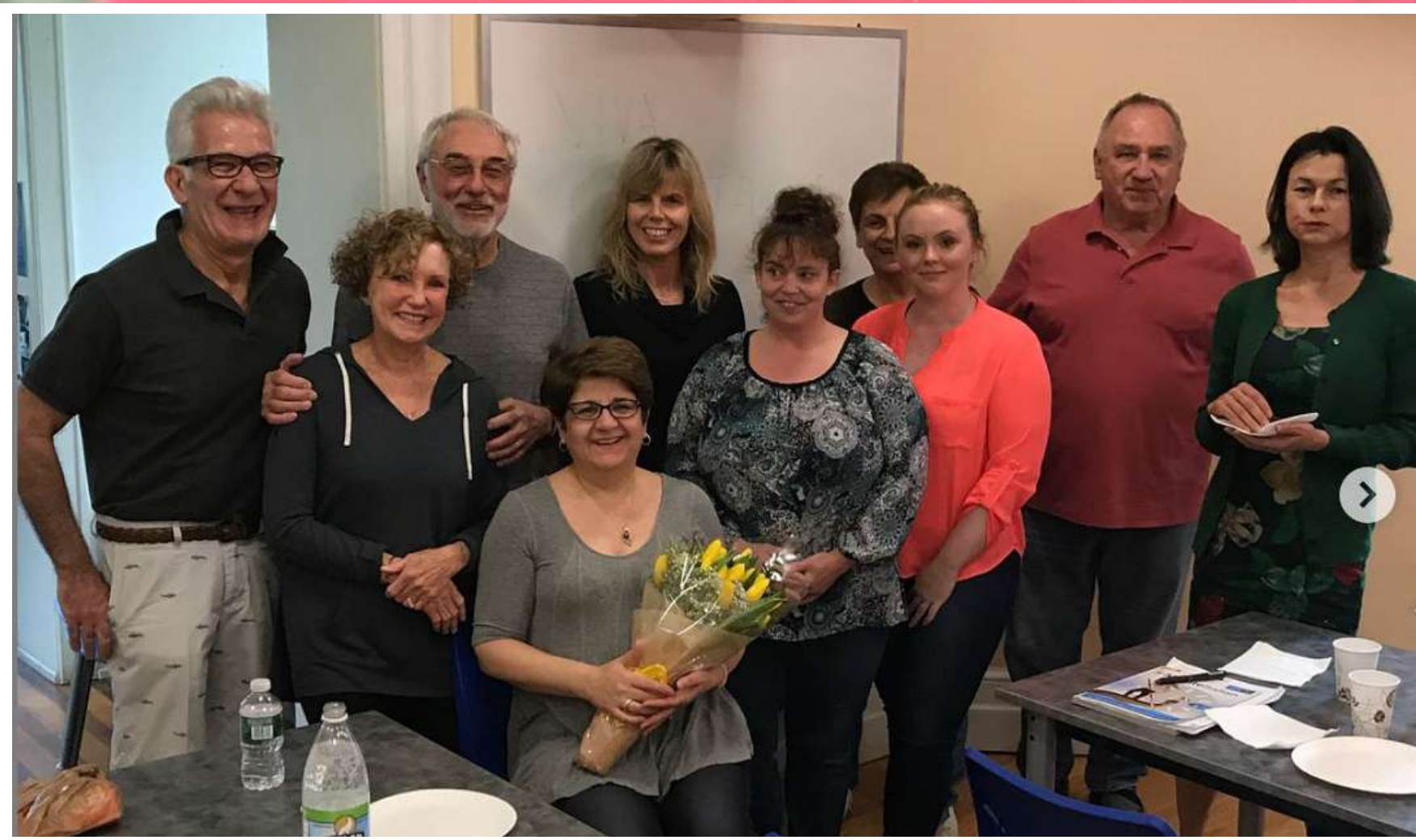
La Dolce Lingua Italian class

In 2019 look for a Summer Reading Program featuring local connections, new adult creative and business programming, more tech tools to borrow, and ever increasing opportunities to explore, connect, learn, and shine!